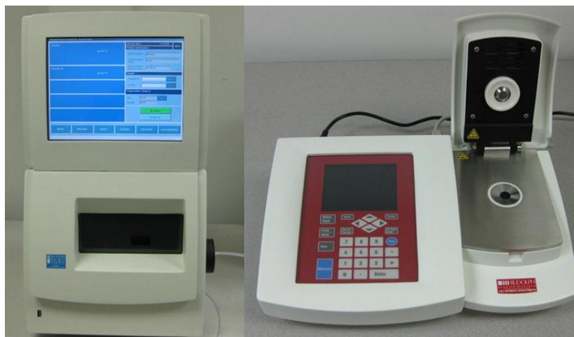
Rudolph Research Analytical DDM 2911 Density Meter (left) and J357 Automatic Refractometer (right)

our new instruments to better understand the properties of solutions, suspensions, particles in suspensions, liquids, and liquid-solid interactions.