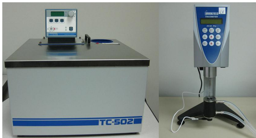
Brookfield Engineering TC-502D Circulator Bath (left) and DV-II+Pro Viscometer (right)