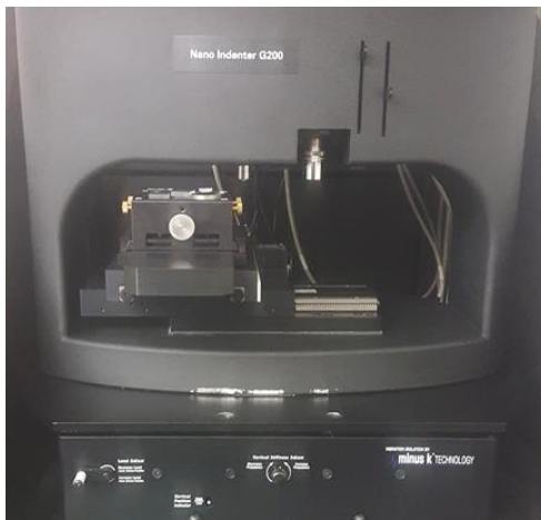
Figure 1. G200 Nanoindenter inside its environmental enclosure.

Polymers like polycarbonate can swell or absorb surrounding fluid when immersed in a fluid for a prolonged period of time. Depending on the amount of swelling, the mechanical properties of the polymer can change dramatically. To quantify the effect of fluid absorption has on polycarbonate, three sample pieces of polycarbonate were soaked in different solvents while a fourth piece was kept dry as a control. The samples then underwent nanoindentation depth profiling testing using Ebatco's G200 Nanoindenter. An image of the G200's main components is shown in Figure 1.