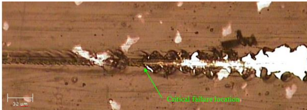
Magnified view of critical failure location of the paint coating on a Pepsi can.